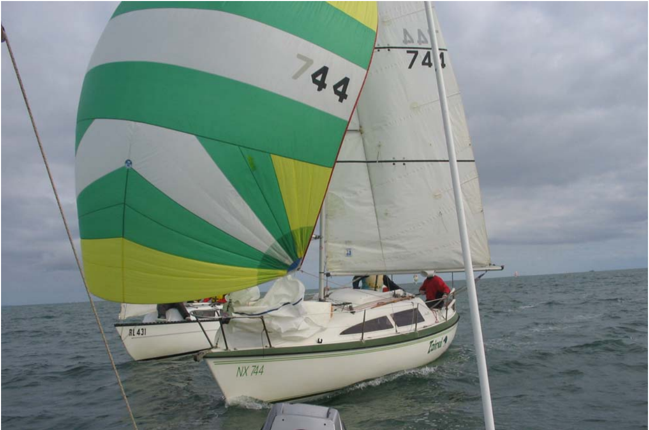
Tainui and Liaison just behind No Excuses