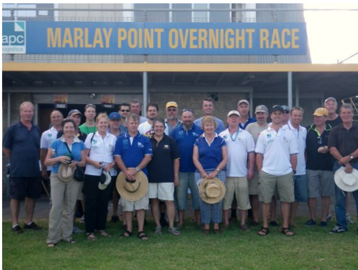
MTYC Members photographed at Marlay Point prior to this years overnight racer