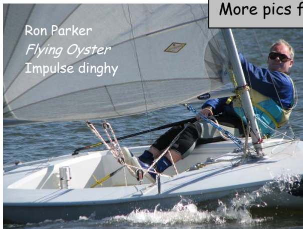
More pics from Easter at Yarrawonga