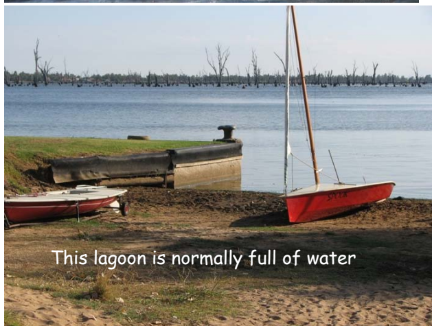
This lagoon is normally full of water