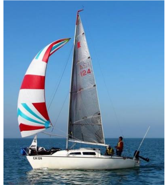
Stella Reardon "Mad Mouse"

2nd Twilight Series CBH 2nd Twilight Series PBH