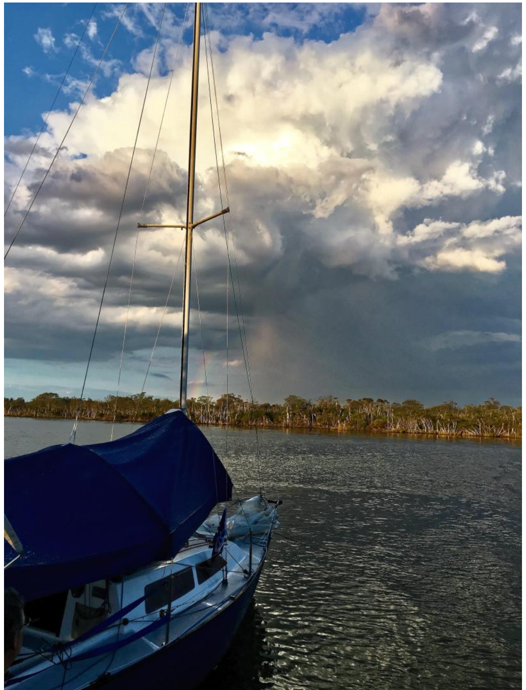
Mystic Jim Reynolds