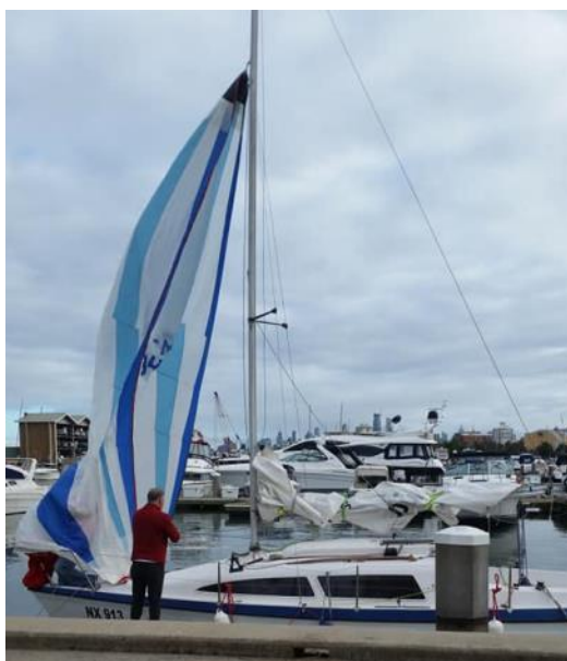
Adrian Cassar "Night Sky"

1st Winter Series PBH 2nd Winter Series CBH 3rd Summer Short Course Series CBH 3rd Summer Short Course Series PBH 3rd Twilight Series CBH