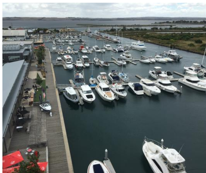
View of Queenscliff Marina...