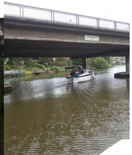
Raleigh Road Bridge