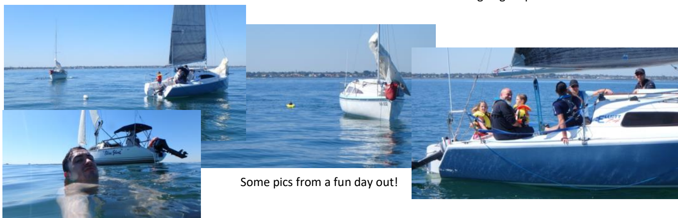
Some pics from a fun day out!