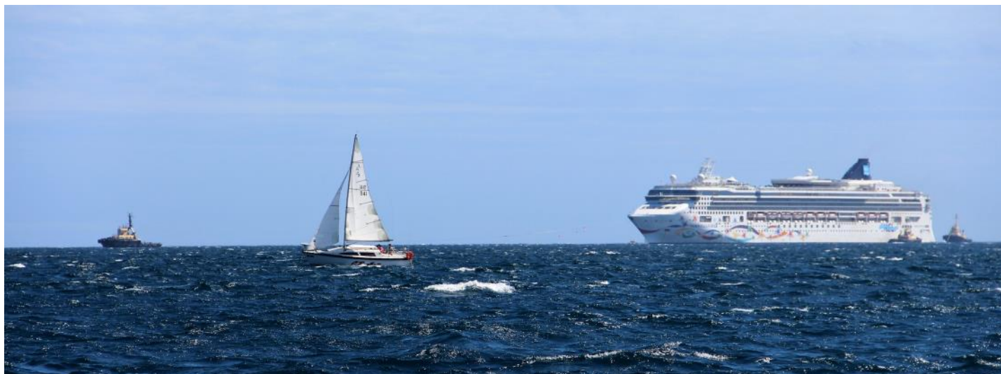
O'Really II lends a hand to the tug boats that rescued the 'Norwegian Star' that was towed from Wilsons Promontory back to Melbourne after losing engine power.