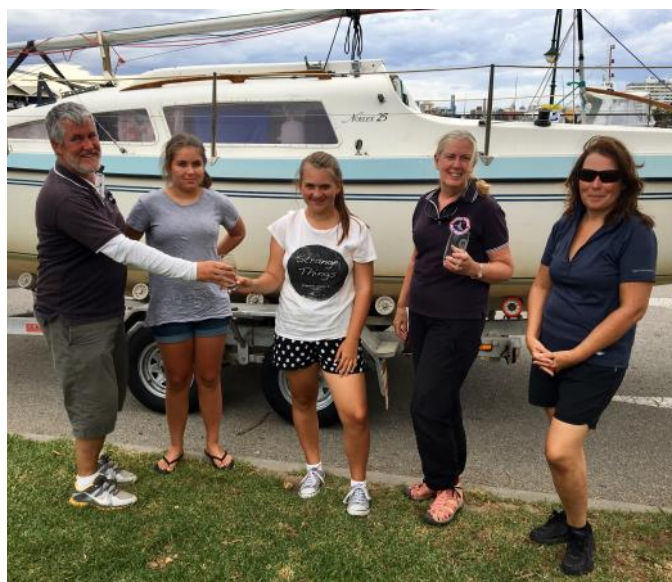
Competitors in the last women skippers race...