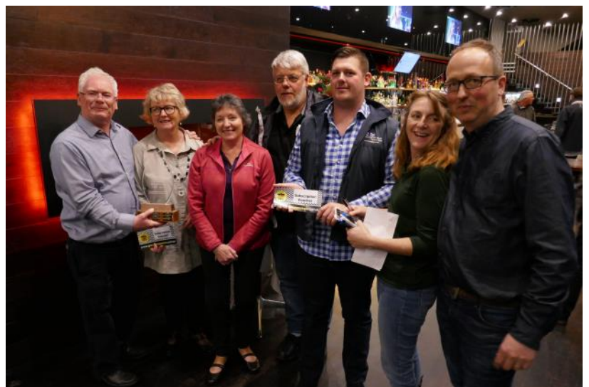
More pictures from Season Opening, including presenters and winners of the Quiz!