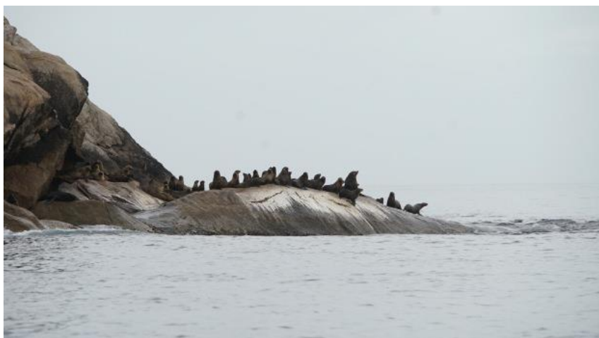
Seals on Ile de Phoques

Weekly Benefit 100% of pre-injury Salary, if prevented from working in your Occupation up to maximum $ 300 per week. The Benefit period is 52 weeks & the excess is 7 days.