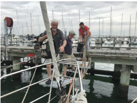
Boarding at HBYC

Oct 23: Yesterday we connected up our AIS transponder and it works! All commercial shipping has to have real-time tracking of position and movement, but we feel it will be of great comfort to know that our small presence will also show up on the big boys' navigation screens.