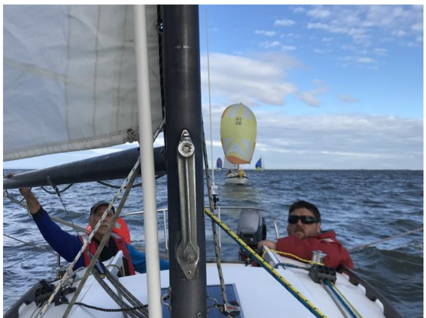
WAFIR Feb 2021