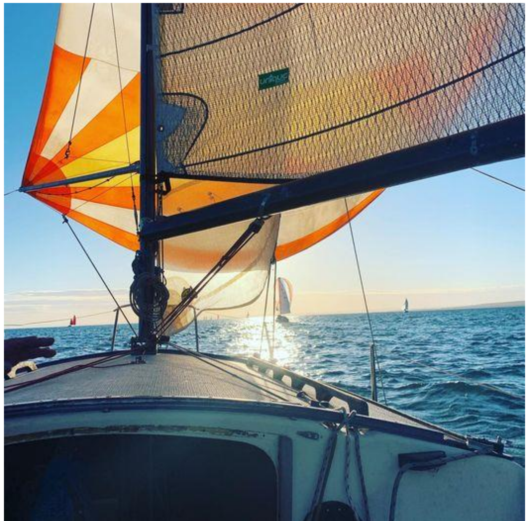
Juniper WAFIR Feb 2021