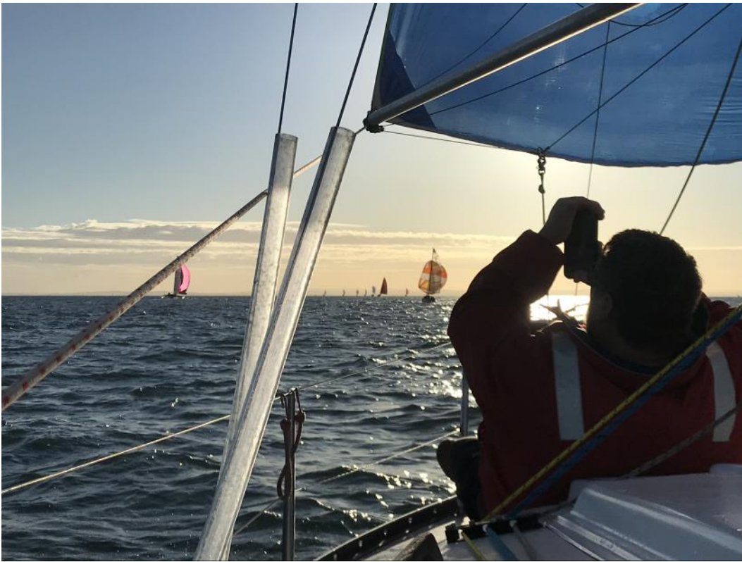
WAFIR Feb 2021