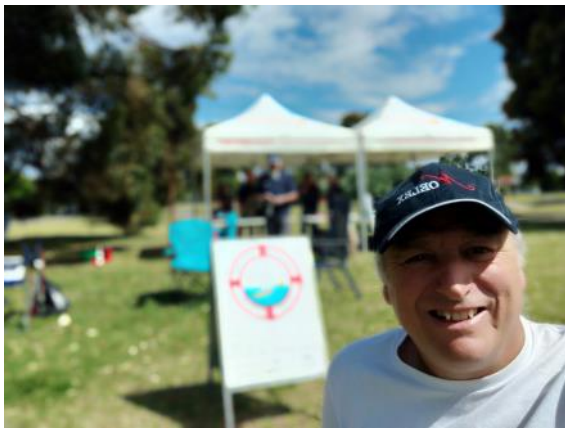
Christmas Party Port Melbourne Dec 2020