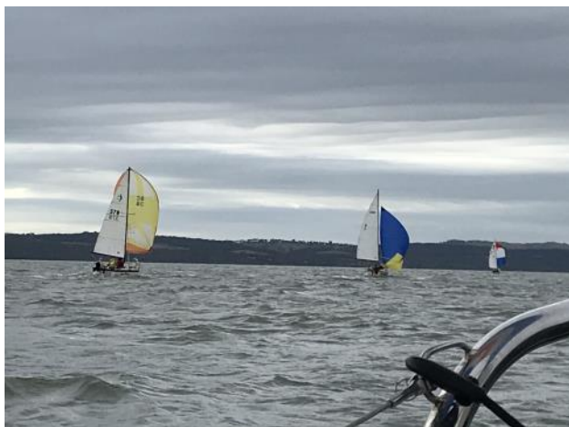
Jibsheets March 2021