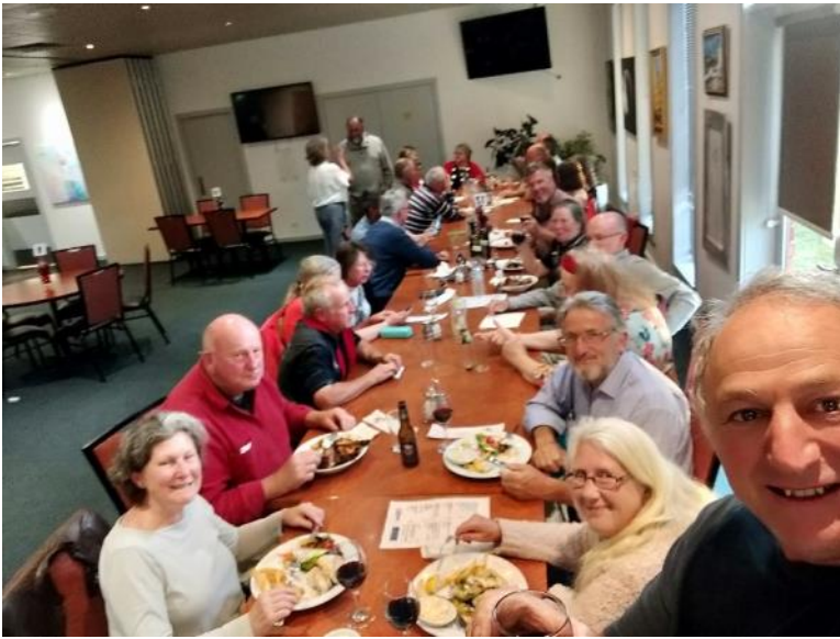
Port Albert Weekend December 2020—racing abandoned!