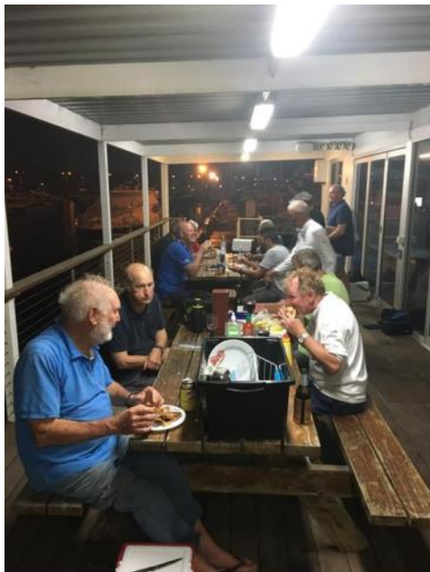
Post Twilight BBQ Thurs 11 Feb

https://www.vicroads.vic.gov.au/-/media/files/documents/business-and-industry/class-o-rear-overhang-exemption_v2_june-2017.ashx?la=en&hash=6634E917C700E0D54BFA1B83AFDCE6EE