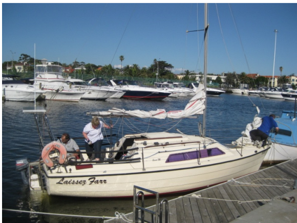
Thursday night race "Laissez Farr" departing the marina