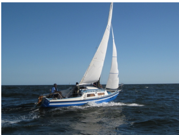
Thursday night race "Alicia 11"