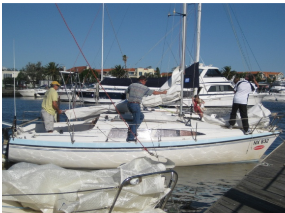
Thursday night race "Night Crossing" departing the marina