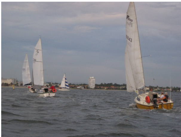
Thursday night - leaders in fleet heading for finish line