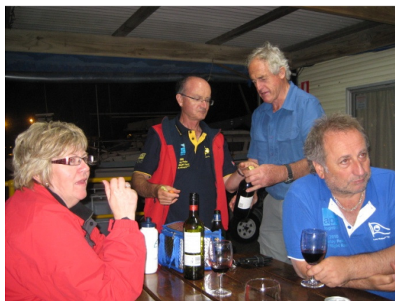
Thursday night Post Race at the Coast Guard