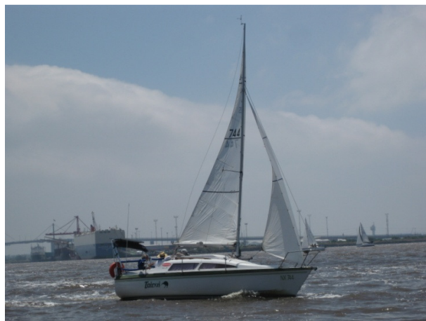
“Tainui” Passage Race in Jan 2011