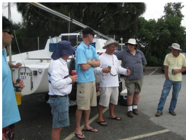
Post-mortem following Passage Race in Jan 2011