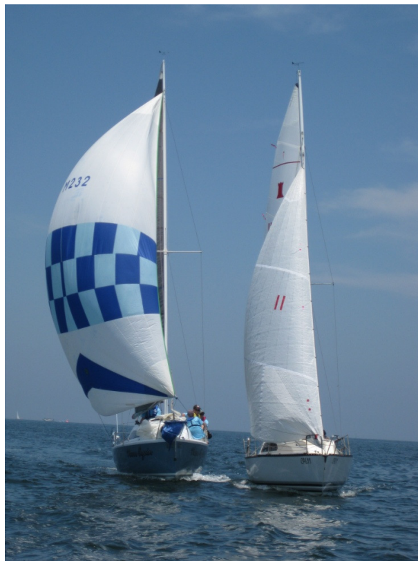
December race “Never Again” overtaking “Court Gester”