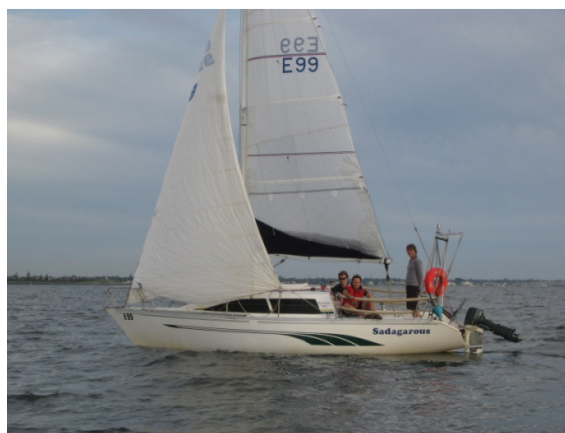
Thursday night race "Sadagerous"