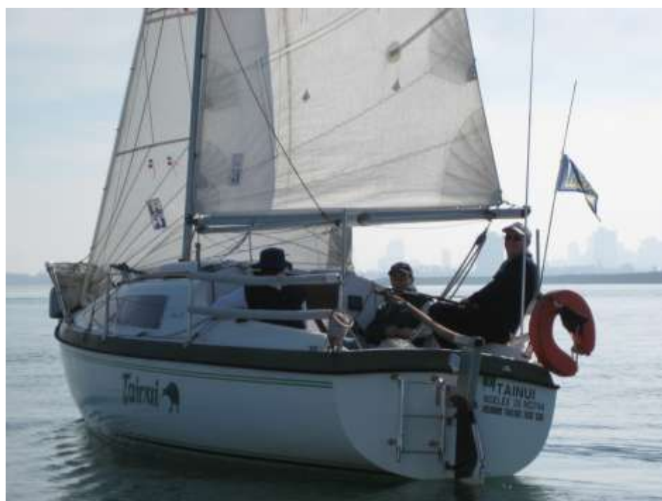
"Tainui" in light conditions racing on 16 th May 2010