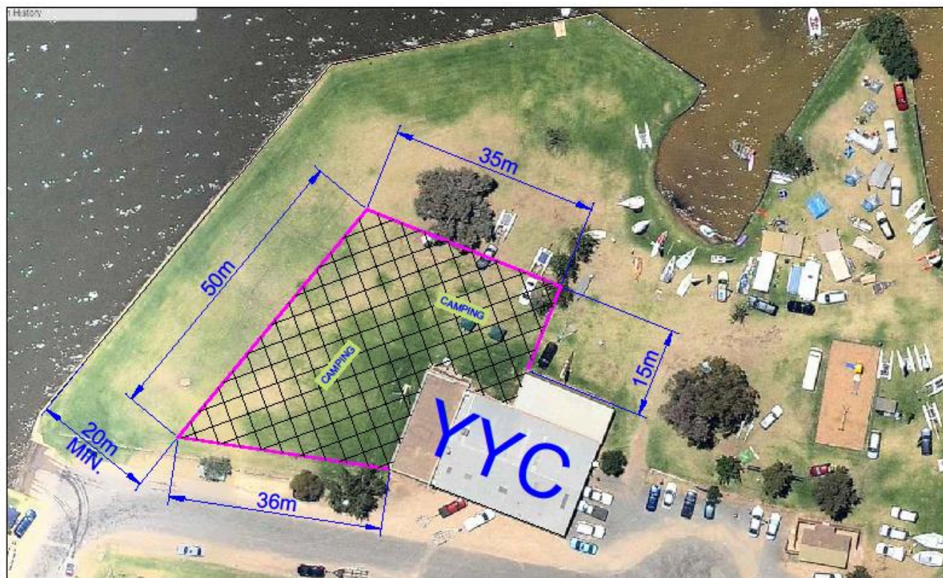
REGATTA CAMPING AREA