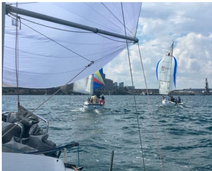
Pelican Race final stages div 2