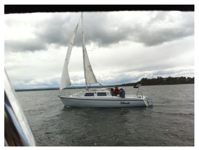
View of boats from Chateau Tabilk