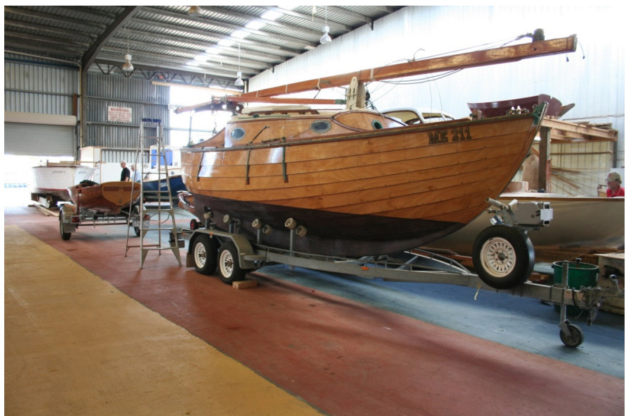
Trailable boats of all sizes in the Wooden Boat Centre

The Wooden Boat Centre builds wooden boats and provides the facilities for individuals to build their own boats. A great collection of projects are always on the go. As well as many restoration projects there are many new building projects on the go and all sizes of boats — some even Trailable!! Further information <a href="http://www.woodenboatcentre.com.au/index.htm">http://www.woodenboatcentre.com.au/index.htm</a>